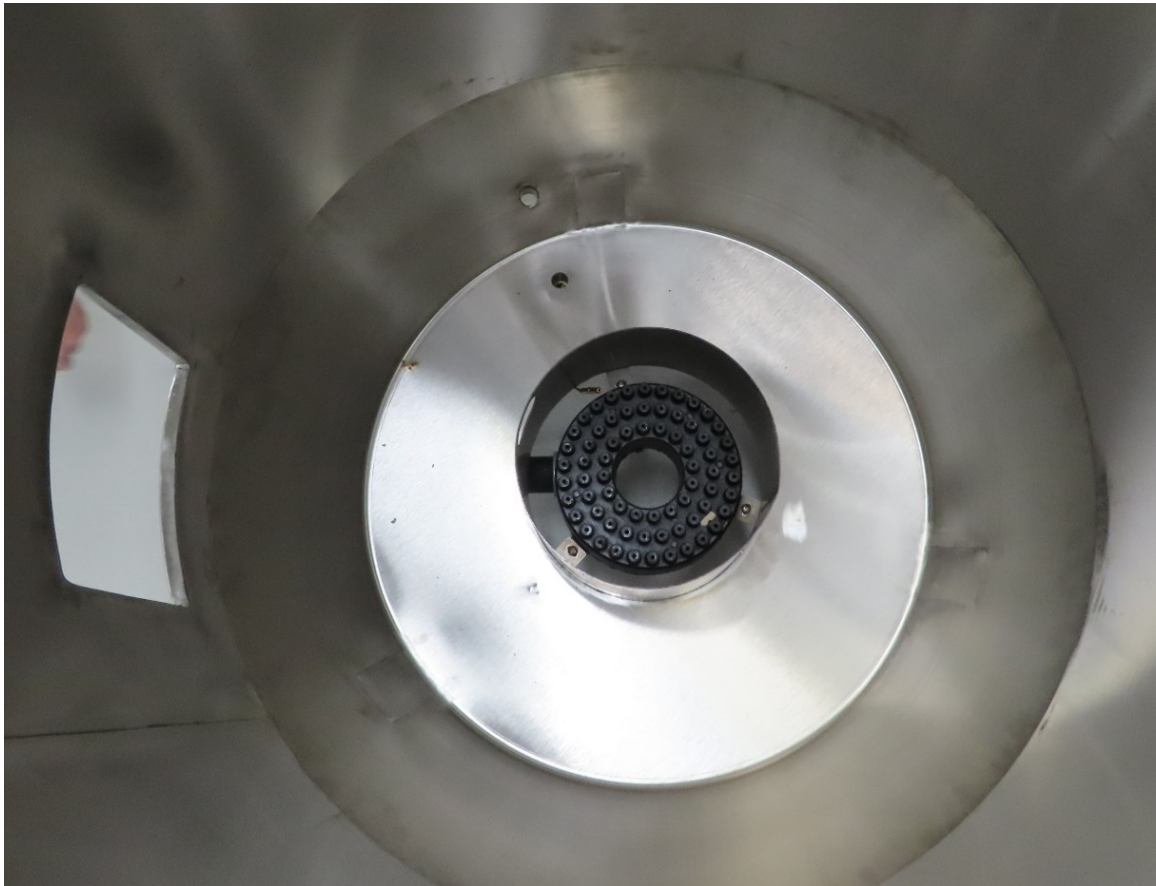
Example of prohibited appliance main burner.