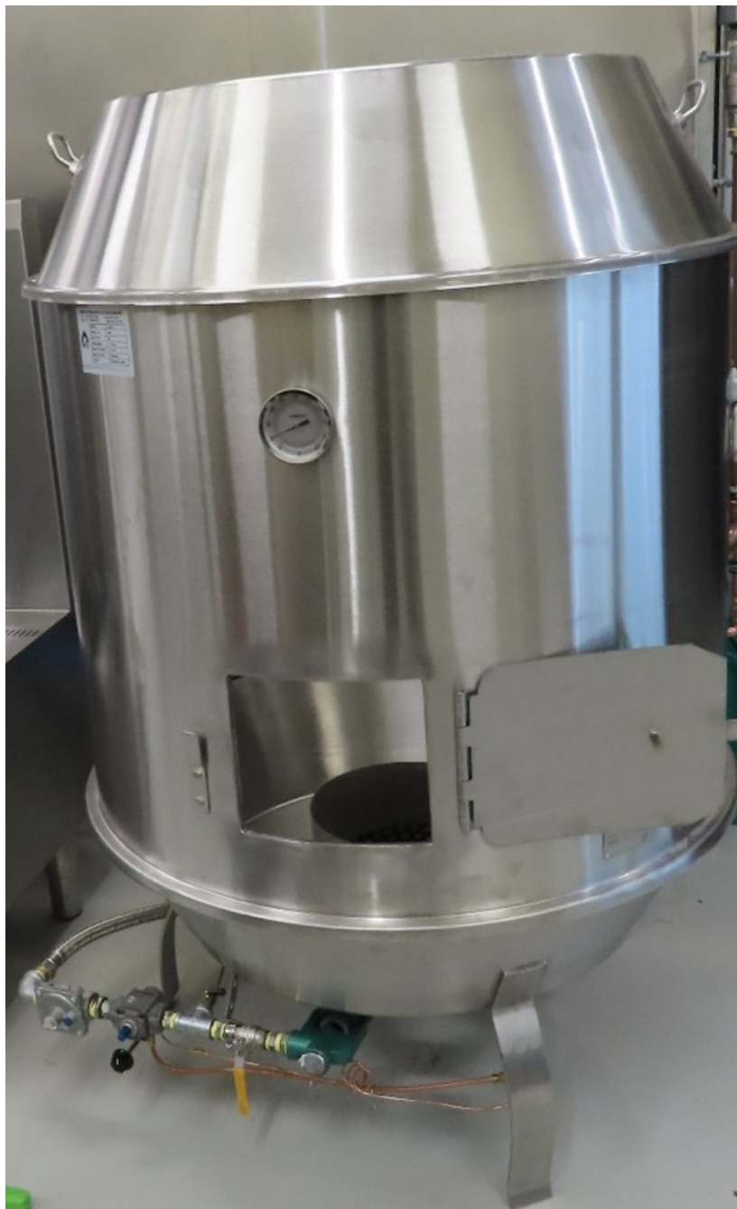
Example of prohibited appliance.