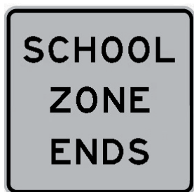
Example "School zone ends" sign