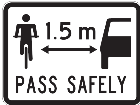
Example: Pass safely sign Option B.

Note: The dimensions, descriptions and terms contained in Schedule 1 conform with the opening notes in Schedule 1, Land Transport Rule: Traffic Control Devices 2004.