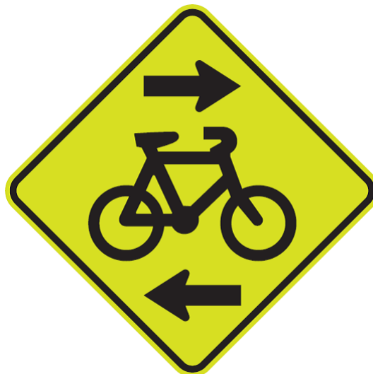
Example: Cycle path crossing sign.