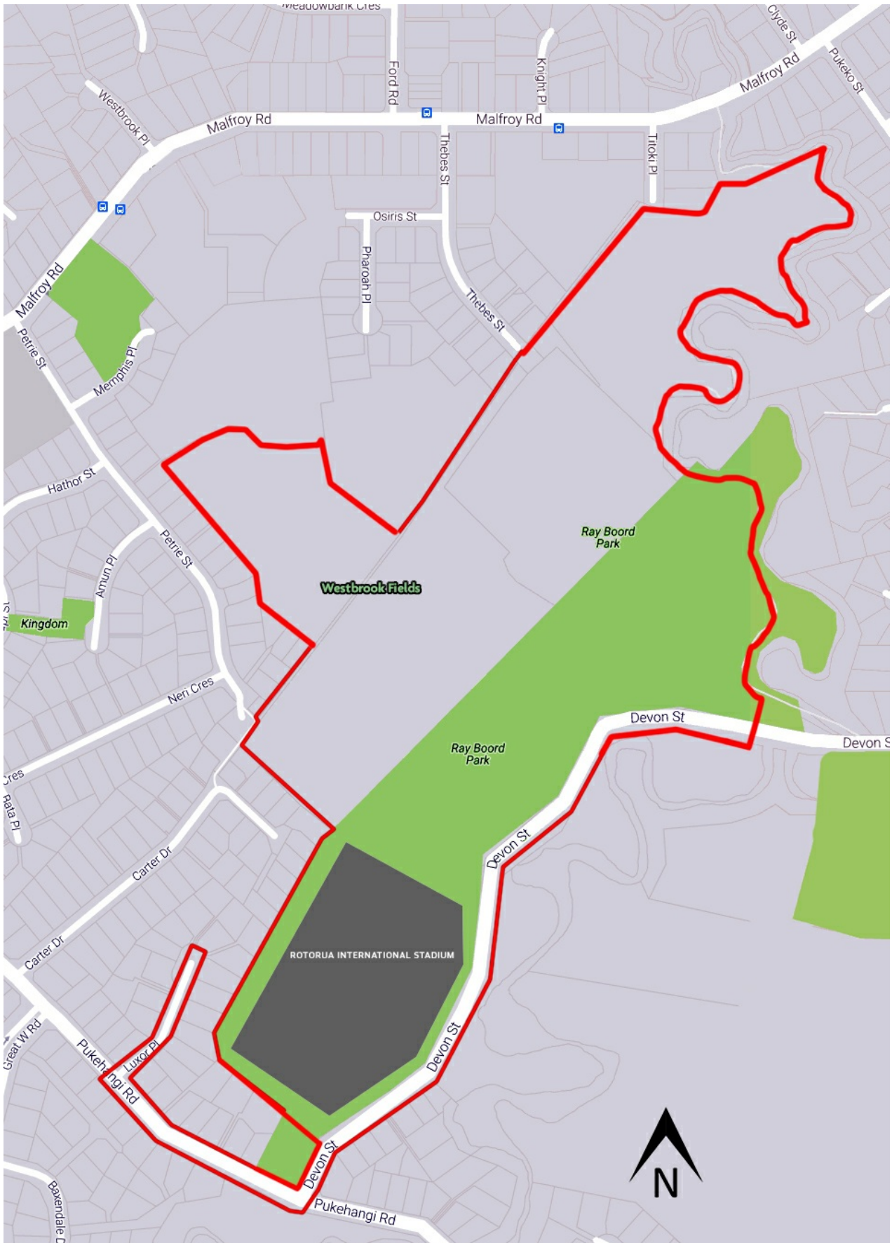
Schedule 5: Westpac Stadium, Wellington Proposed Clean Zone