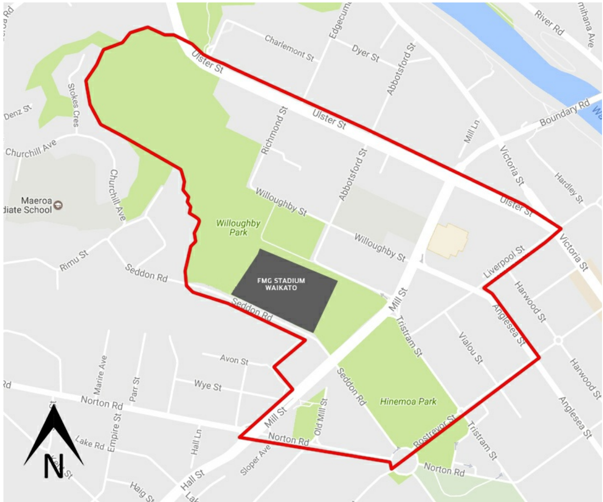
Map C: FMG Stadium Waikato Clean Zone

The FMG Stadium Waikato clean zone will apply from 6.00am on Tuesday 20 June 2017 until 11.59pm on Tuesday 20 June 2017.