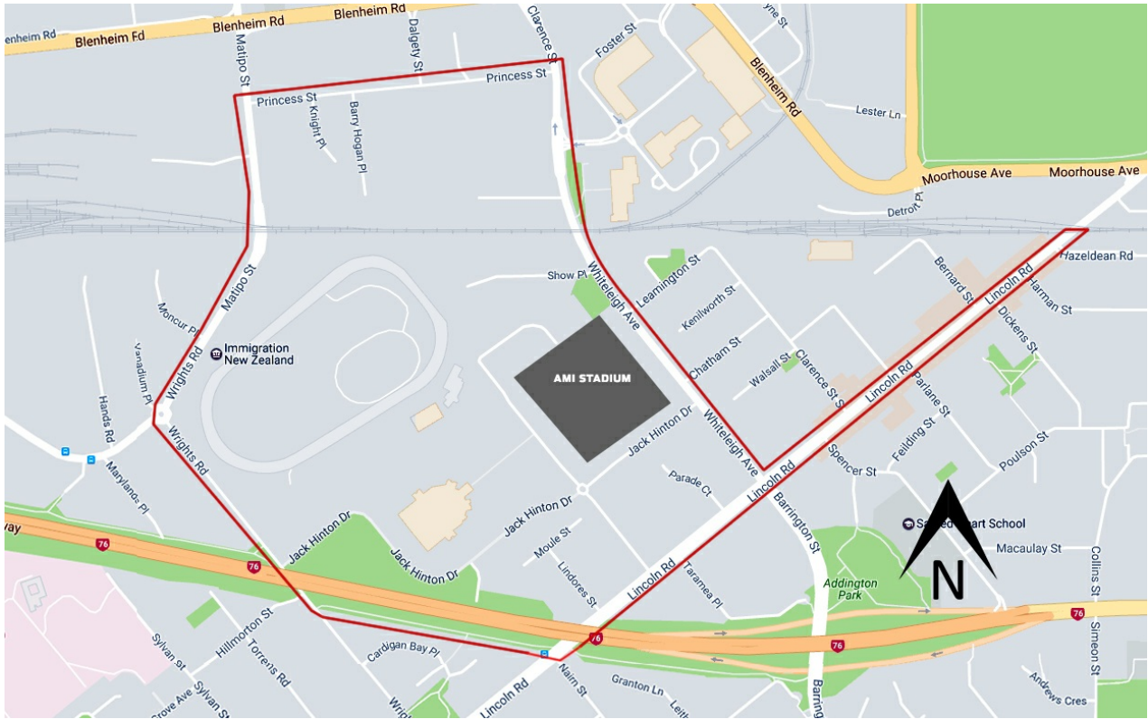
Map F: AMI Stadium Clean Zone

The AMI Stadium clean zone will apply from 6.00am on Saturday 10 June 2017 until 11.59pm on Saturday 10 June 2017.