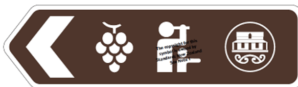
Example: Tourist features adjacent to road chevron sign