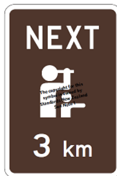
Example: Next tourist feature sign