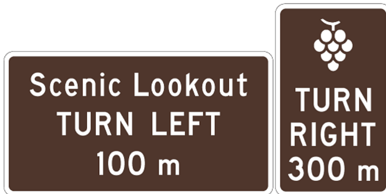
Example: Advance tourist feature on side road signs Option A (left) and Option B (right)