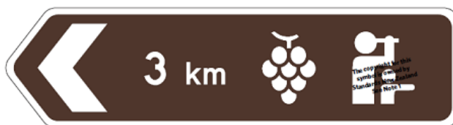
Example: Tourist features on side road chevron sign