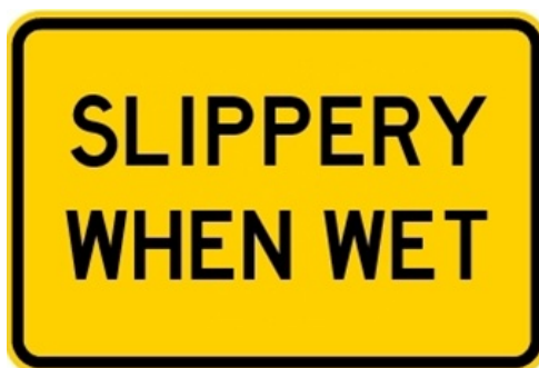
Slippery when wet supplementary sign.